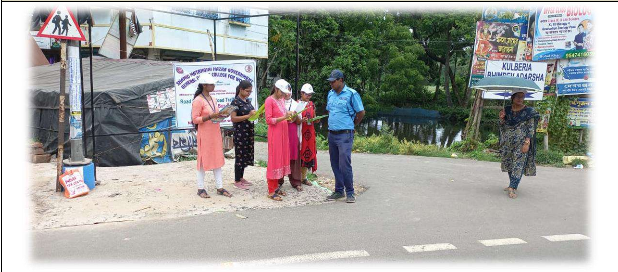
Photograph of Road Traffic and Air Pollution Awareness Programme Place: Kulberia Road Date: 10.05.2023