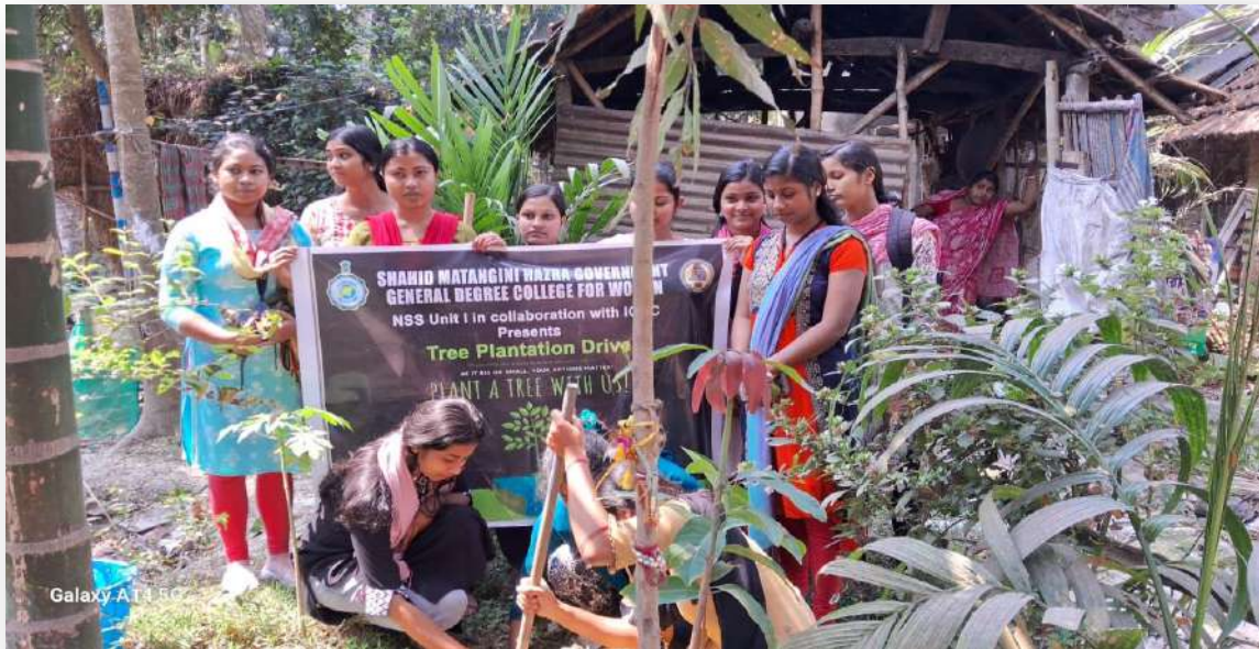
Photograph of Tree Plantation Drive