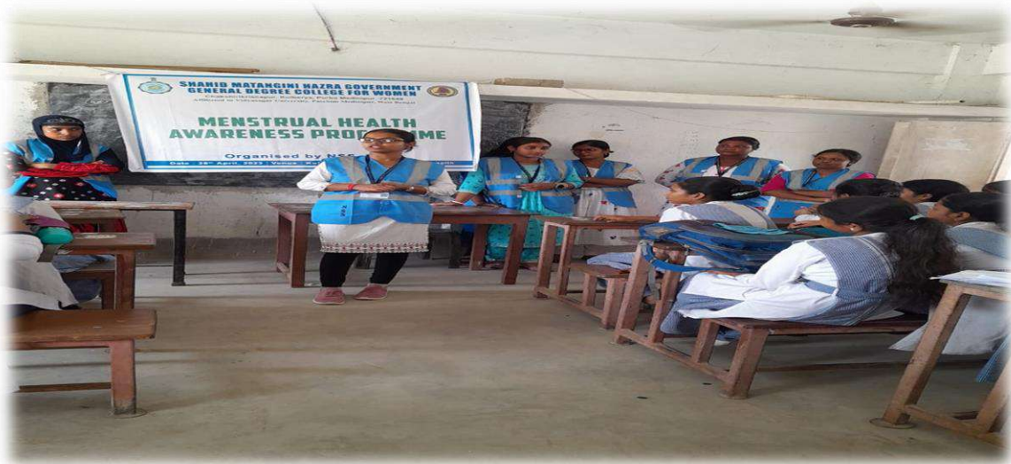
Photograph of Menstrual Hygiene Awareness Program Place: Kulberia Bhimdev Adarsha Vidyapith Date: 28.04.2023