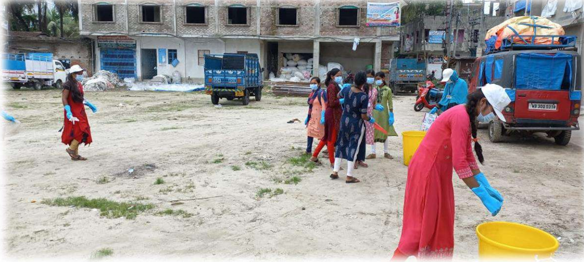
Photograph of Swachh Bharat: Clean India Mission Campaign

Place: Kulberia Bhimpur Fair ground Date: 06.04.2023