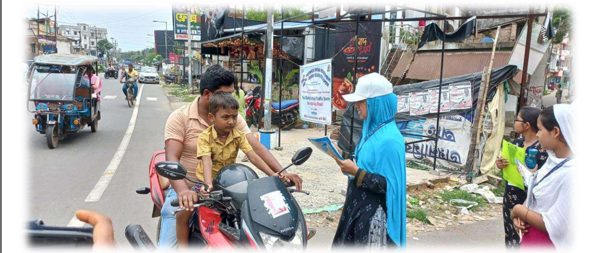
Photograph of Road Traffic and Air Pollution Awareness Programme Place: Kulberia Road Date: 10.05.2023