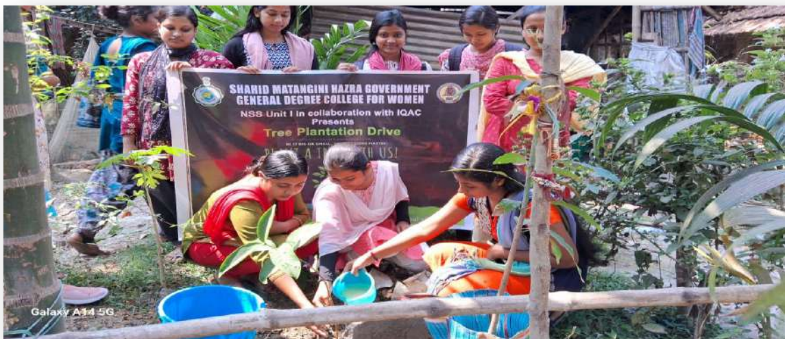
Photograph of Tree Plantation Drive