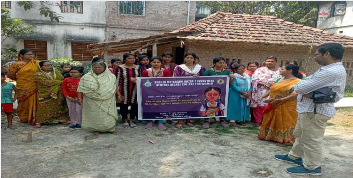
Photograph of Extension Activity on Awareness Generation on Prevention of Child Marriage Place: Bhandarberya Village Date: 23.03.2023