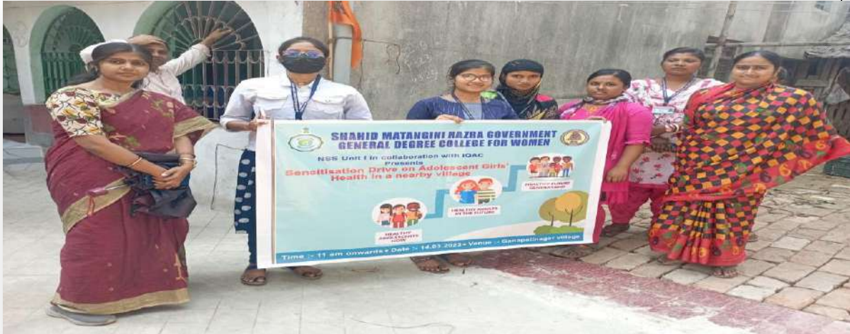
Photograph of Extension Activity on a Sensitisation Drive on Adolescent Girls' Health Place: Ganapatnagar Village Date.: 14.03.2023