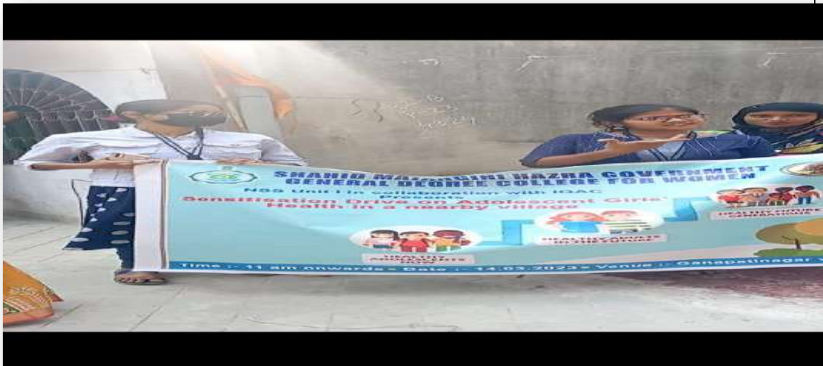
Photograph of Extension Activity on a Sensitisation Drive on Adolescent Girls' Health Place: Ganapatnagar Village Date.: 14.03.2023