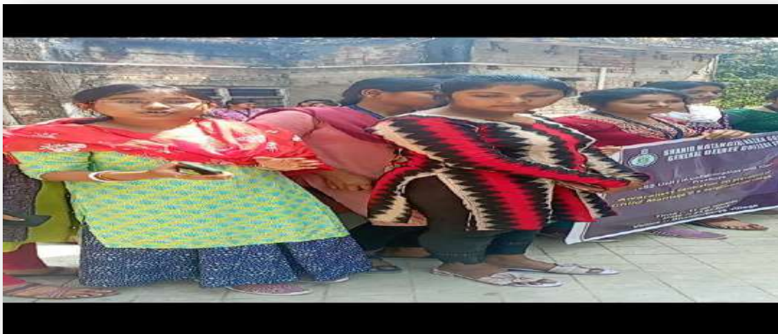
Photograph of Extension Activity on Awareness Generation on Prevention of Child Marriage Place: Bhandarberya Village Date: 23.03.2023