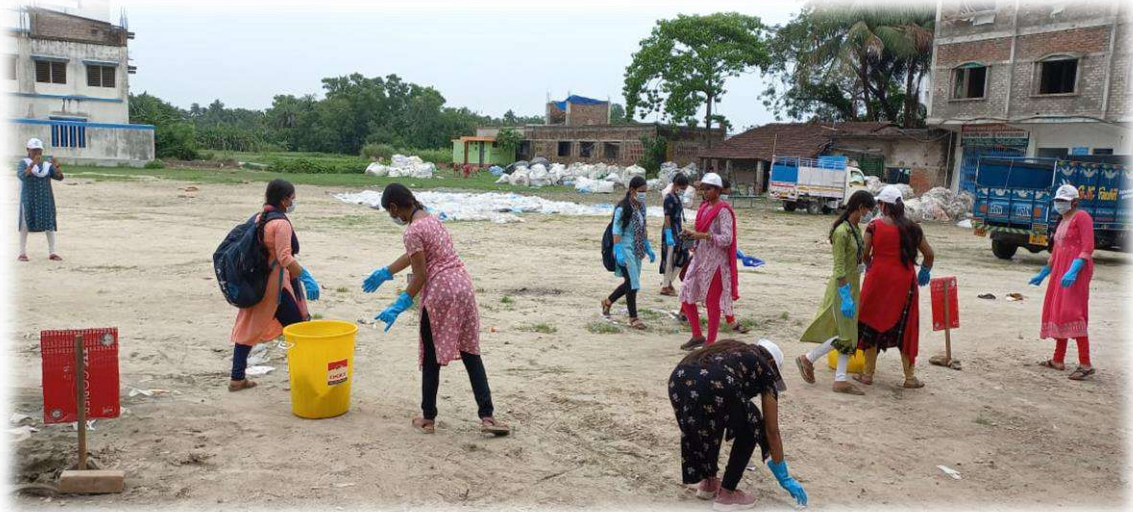
Photograph of Swachh Bharat: Clean India Mission Campaign

Place: Kulberia Bhimpur Fair ground Date: 06.04.2023