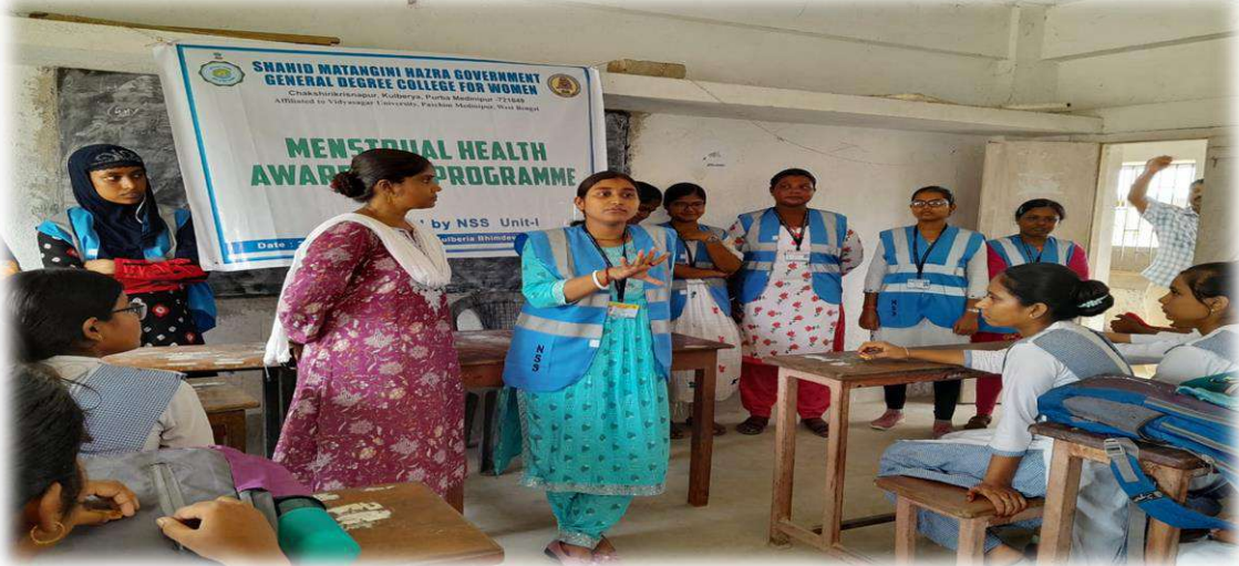
Photograph of Menstrual Hygiene Awareness Program Place: Kulberia Bhimdev Adarsha Vidyapith Date: 28.04.2023